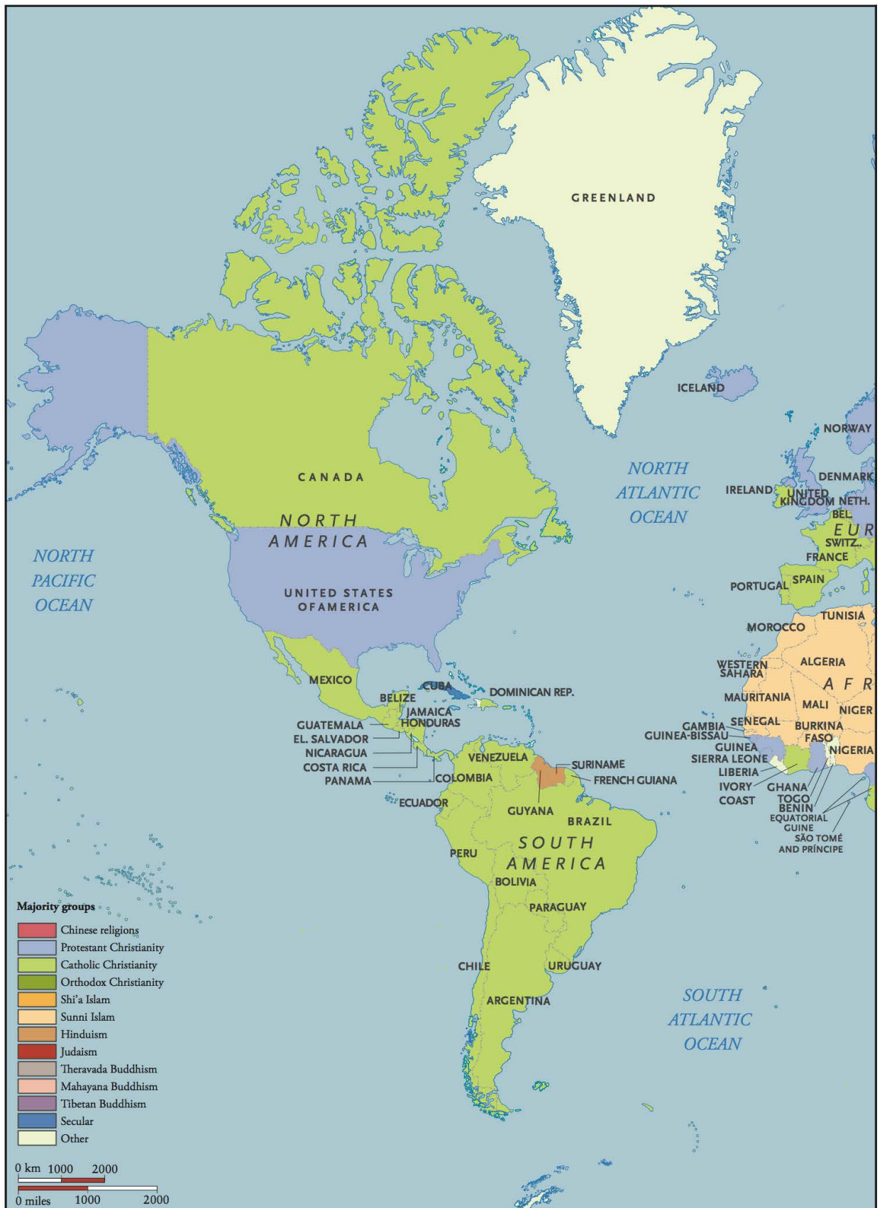
World religions today.