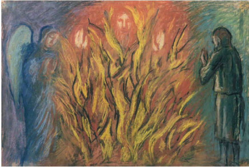
Moses and the Burning Bush (1990), charcoal and pastel on paper by Hans Feibusch. In the drawing, God reveals himself to Moses in a bush that is on fire but not consumed by the flames. The event is described in Exodus, the second book of the Hebrew Bible (Old Testament).

by Buddhists to be a state of perfect bliss and ultimate fulfillment. According to Otto, nirvana involves too much fascinans without enough mysterium tremendum .