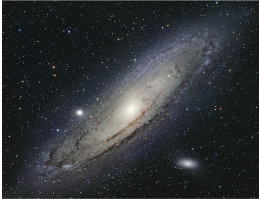
The Andromeda Galaxy.

Explanations regarding what it is to be human also figure largely into ethical or moral considerations. Are we by nature good, evil, or somewhere in between? Religions tend to recognize that human beings do not always do the right thing, and they commonly offer teachings and disciplines directed toward moral or ethical improvement. To say that we are by nature good, and at the same time to recognize moral failings, is to infer that some cause external to our nature is causing the shortcoming. If we are by nature evil, on the other hand, or at least naturally prone to doing