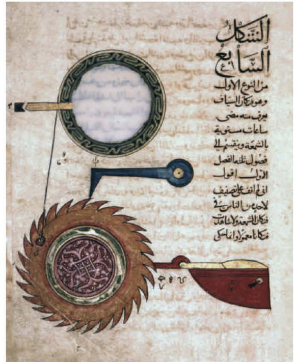
A miniature illustration from the “Automata of al-Jazari,” a Muslim scholar, inventor, engineer, mathematician, and astronomer who lived from 1136 to 1206.

This is not to say that comparison should be undertaken haphazardly or with intention only to discover similarities while ignoring differences. Those critics mentioned earlier who deride the “world religions discourse” tend to be suspicious of attempts at comparison, claiming that too often similarities are indeed valued over differences and that the categories used to make comparisons tend to privilege Christianity over other traditions. Sometimes the results of the comparison of religion differentiate religions into groups that are too sweepingly general: for example, “Eastern” and “Western” religions. Still, the benefits of comparative analysis outweigh the risks, and the potential pitfalls that these critics appropriately warn against can indeed be avoided through a conscientious approach.